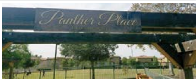
Fayroze Mostafa Principal

taught that their actions and words are very powerful and that a simple gesture of giving a compliment to a different person each day can make a difference.