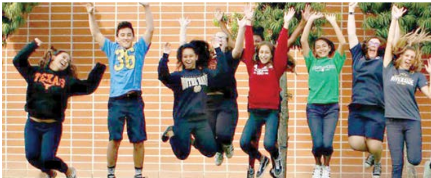
Every Monday, Cerro Villa students wear shirts from various colleges of their choice.