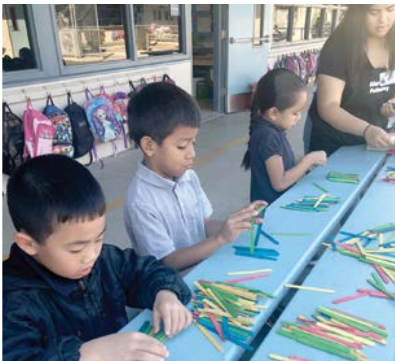
El Modena High School students support 1st graders with a STEM activity.

of Esplanade teachers, El Modena students work in classrooms, assisting in a variety of activities. They facilitate learning centers, read with students, play math games, run PE activities, supervise science experiments, and assist teachers with preparation of classroom activities. Esplanade's students enjoy working with their cross-age tutors and look up to them as positive role models. Both Esplanade students and El Modena students benefit from the partnership between schools which support student learning at both the elementary and high school levels of education.