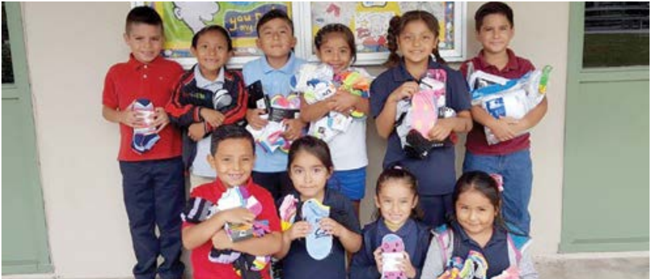
Some of Taft's happy donors

our one week Sock Drive. We created a little competition between the lower grades and upper grades and the lower grade students won, earning a Free Recess. The socks we collected were given to the Coat of Many Colors Ministries for distribution to people in Houston, Texas and Puerto Rico. Taft students and their families love to give to those in need!