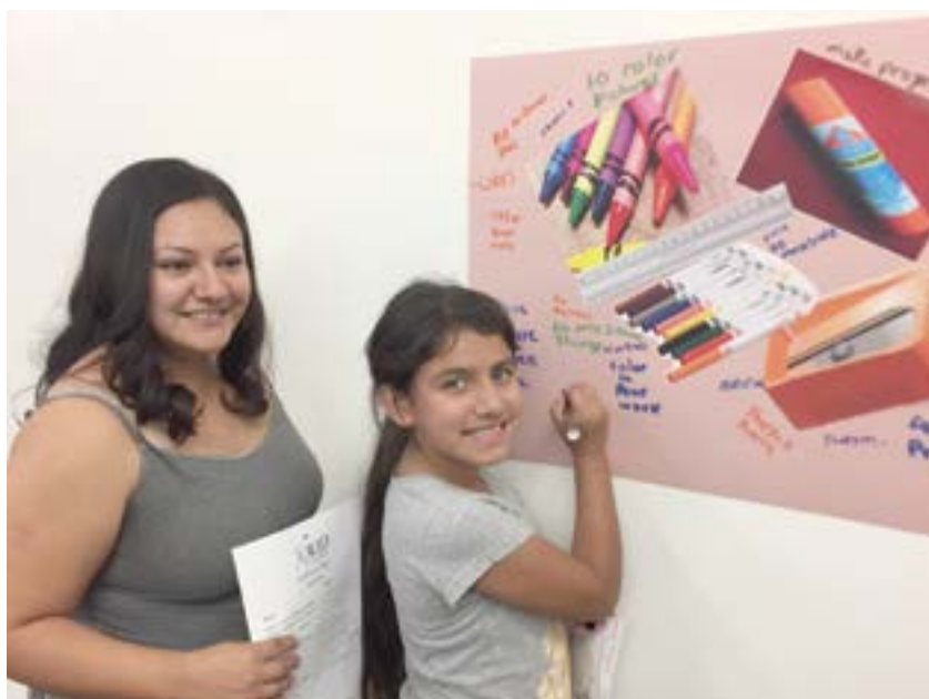
Parents learn about AVID Observational Charts.

our fourth-graders this school year. We look forward to expanding AVID Elementary into the third grade during the next school year.